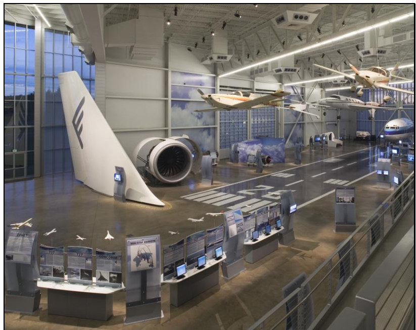
Future of Flight Aviation Center and Boeing Tour

This 75,000 sq. ft. contemporary glass art museum and working arts facility contains exhibition space and a “hot shop” for glass blowing and sculpting demonstrations. Extreme emissions and heat from the kiln required an environmental monitoring system and sustainable approach to save energy. ACEC-WA Gold Award winner in 2003.