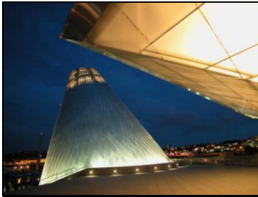
Museum of Glass