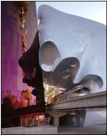
Experience Music Project

A $20 million conversion of space within the Experience Music Project to add performance space and 9,000 sq. ft. of exhibit area. The museum contains an extensive collection of sci-fi memorabilia while an interactive hall of fame profiles sci-fi authors.