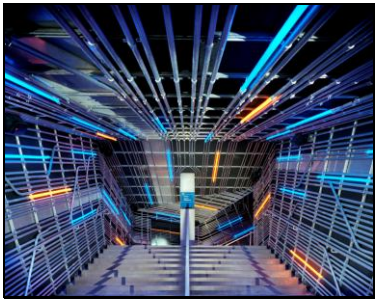
Science Fiction Museum and Hall of Fame