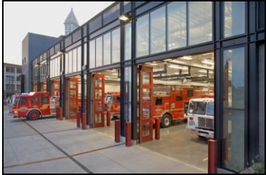
City of Seattle Fire Station 10