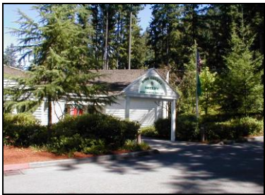
King County Sheriff's Office Precinct 3