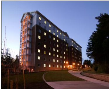
Bremerton Bachelor's Enlisted Quarters