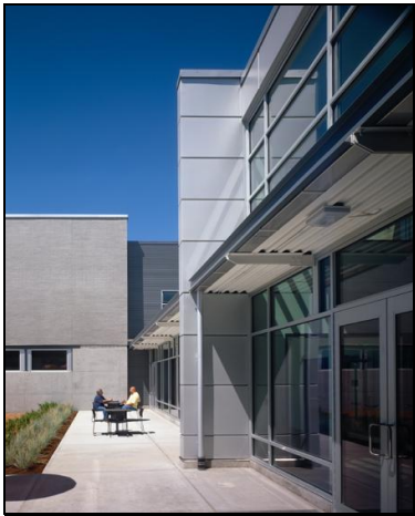
Southwest Community Center