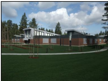
JB Lewis-McChord Nisqually Clinic