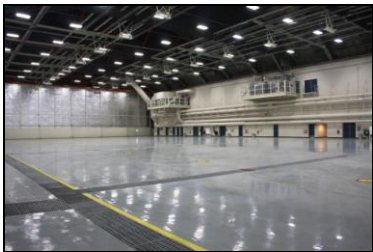
NASWI Hangar 5 Recapitalization

Bachelor's Enlisted Quarters, NBK Bremerton