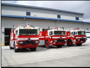
Whidbey Island Fire Station 71