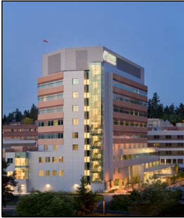
Bartlett Regional Hospital Project 2005, Juneau, AK