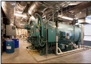
Good Samaritan Hospital CT Scanner Addition, Puyallup, WA